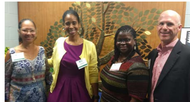
CHS's Board members and staff admire and appreciate the generosity of our partners in the community, and are thrilled to welcome many new supporters to the CHS family every year.