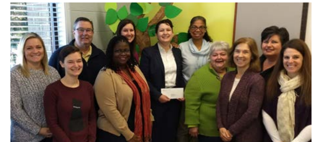
Our staff is grateful for the donations from M&T and countless others that support their critical programs serving vulnerable youth.