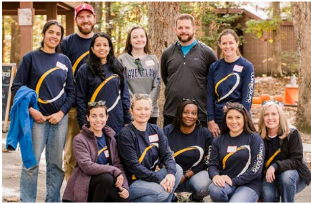
Corporate supporters like Connexions Loyalty provided their employees valuable community service opportunities by partnering with CHS.