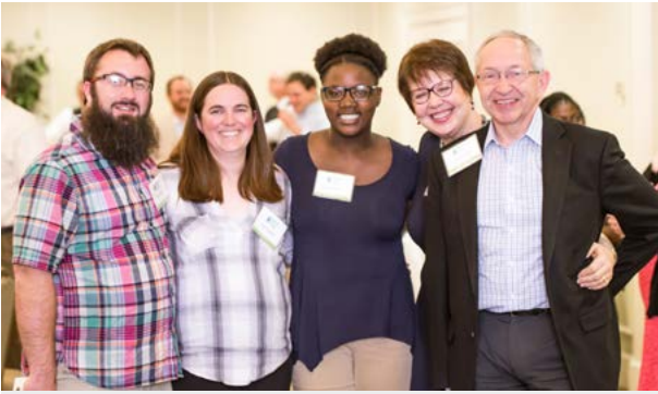
The 2018 Legacy Event was our most successful ever, raising over $100,000 thanks to our guests—and supporters online.