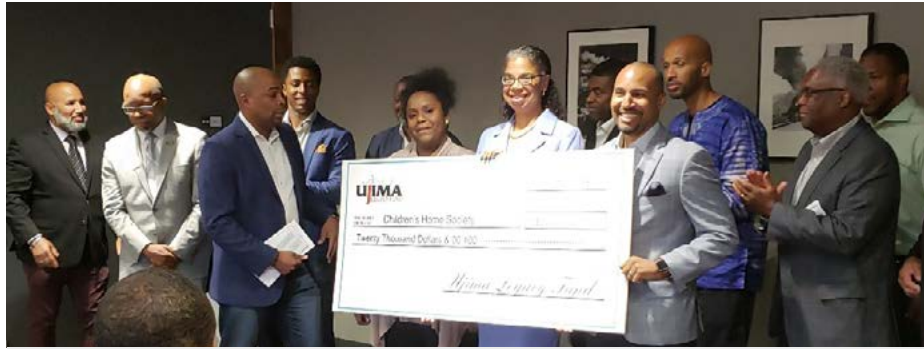
CHS is grateful for the support of the Ujima Legacy Fund.