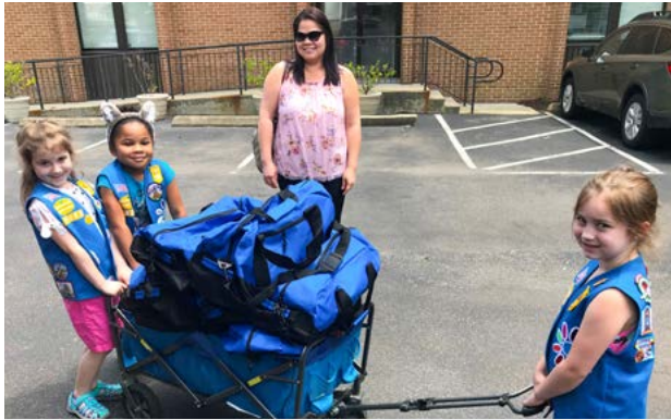
Even the youngest philanthropists recognize the importance of building strong, permanent families for Virginia's at-risk youth.