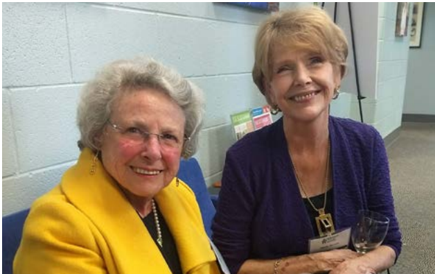
Support from Board and Legacy Society members has helped The Children's Home Society serve over 14,000 children for 119 years.