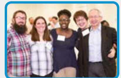
CHS adoptive family with patron and rug raffle-winning couple at the Legacy Event

The impassioned theme of this year's annual fundraising gala, "The Power of Family," was evident in two key-note speakers, our guests, "The Power of Family" video developed just for the event , and even in the decorations. Ultimately, however, the Power of Family was demonstrated by the incredible support of our donors, which allowed us to surpass our initial goal by over 50%. For that, all of us at CHS wish to thank our supporters, sponsors, volunteers and of course our CHS adoptive families, all of whom celebrated and contributed to the Power of Family on a beautiful April 12th evening at the University of Richmond campus.