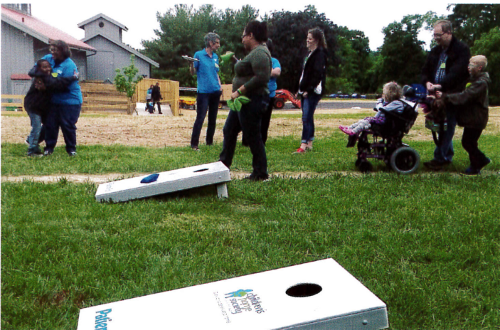
CHS Family Picnic.