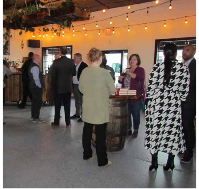
We celebrated our generous donors during our Donor Appreciation Event on Oct 27, 2022.