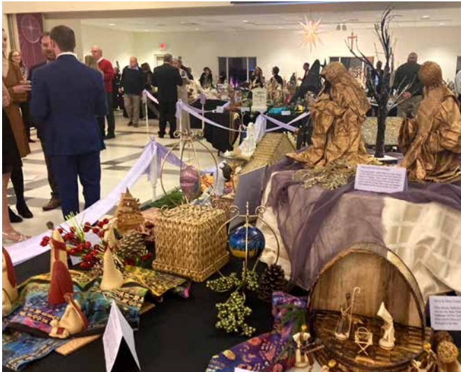
CHSVA received a generous donation from "No Room at the Inn," hosted by Church of the Redeemer in Mechanicsville.