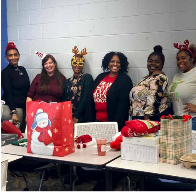
My Path Forward team wrapped the gifts donated to the MPF youth's Holiday Wish Lists.